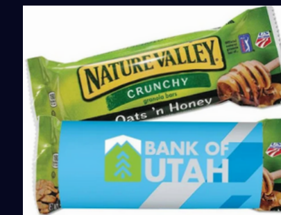
Customized Granola or Candy Bar