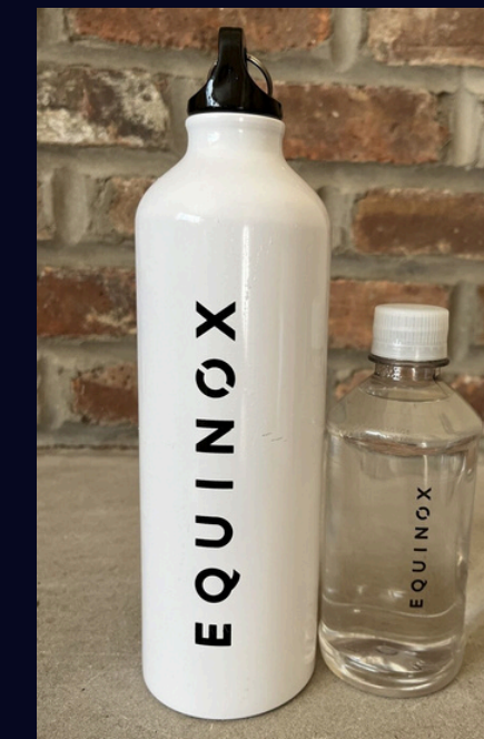
Reusable water bottles