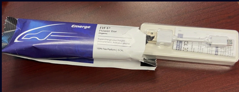
Powerbank with customized Powerbar cover