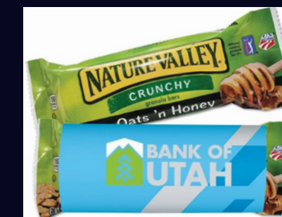
Customized Granola or Candy Bar