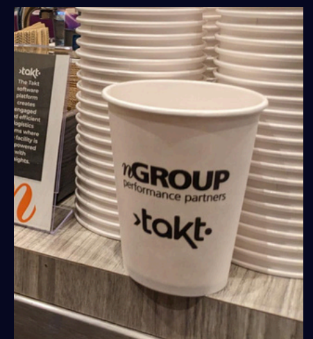
Coffee Cups / Sleeves