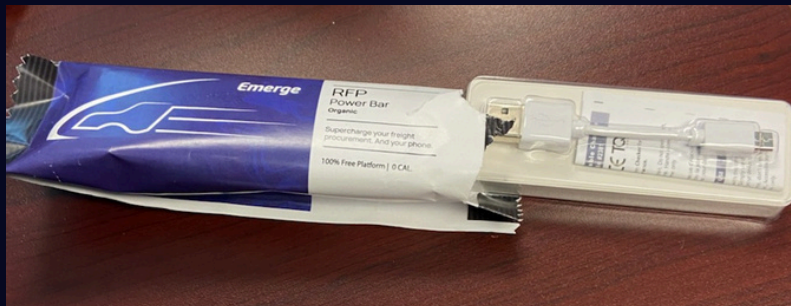
Powerbank with customized Powerbar cover